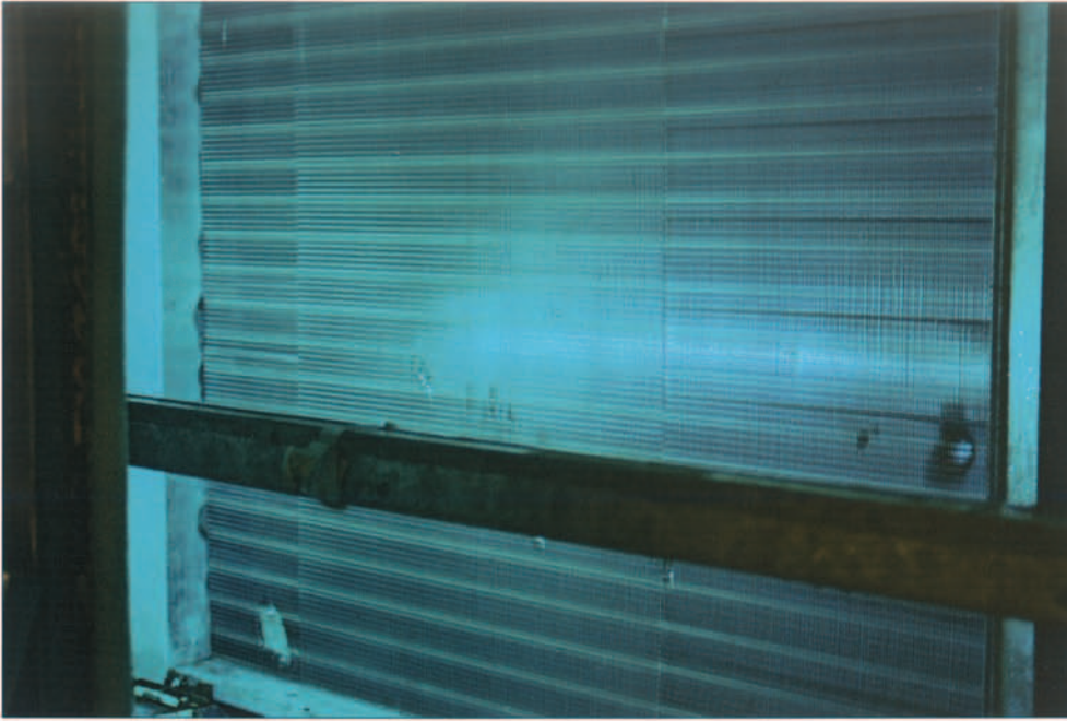
A control unit in one of the early tests, this air handler was later equipped with UVC.

installed the UVC devices more than four years ago. The coil and drain pan areas have also maintained their clean condition, eliminating the necessity for the monthly inspections and twice annual cleanings that used to be required. How is this possible? We have found that the high output UVC energy kills or inactivates both coil and drain pan mold and bacteria (to eliminate their toxins, VOC and spore production, and allergens) as well as ordinary coil and drain pan debris. The result is a continuous form of source control.