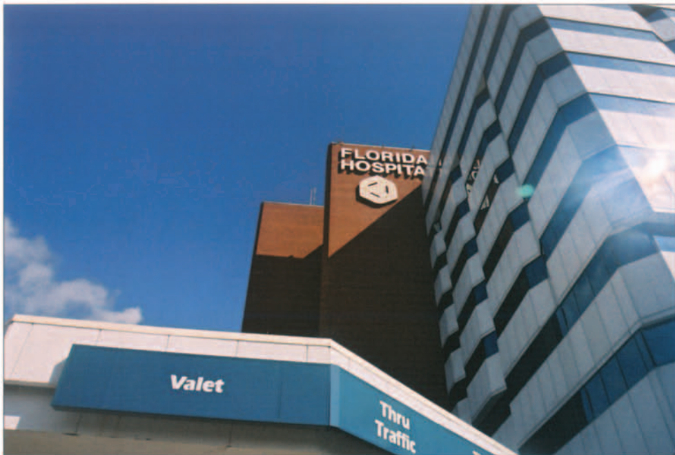
UVC lights have been used in facilities throughout the Florida Hospital system.